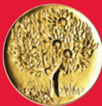
JAPAN QUALITY MEDAL 2007