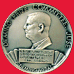
DEMING PRIZE 2003